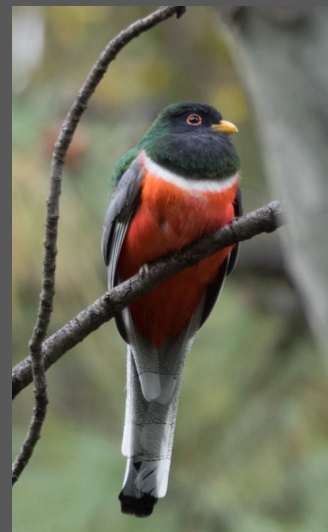
Elegant Trogon, Corry Clinton